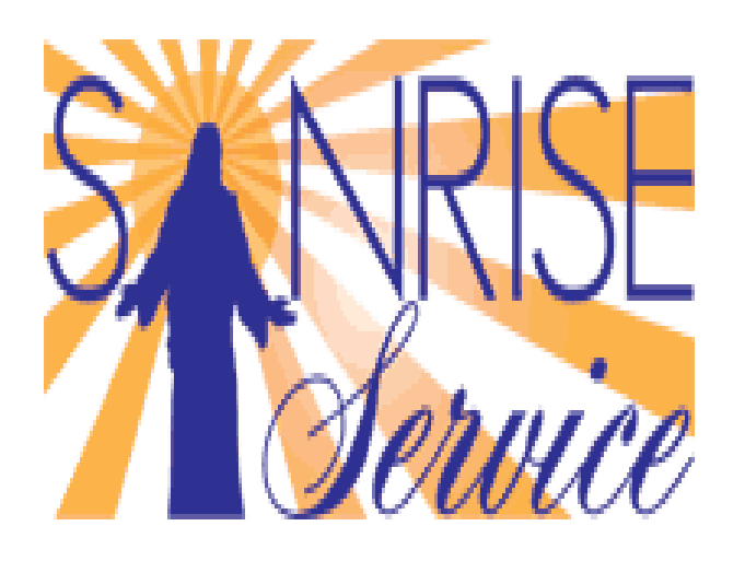
"The Empty Tomb—A Symbol of Victory"